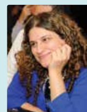
Gabriela Szlak, BC Councilor