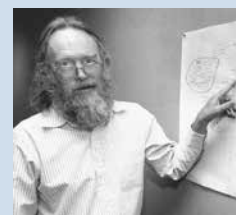
Jon Postel, one of the early founders of the

Domain name registrations don't always correspond with population sizes. Little liechtenstein (.li) has 169.1 domain registrations per 100 people, while America's .us only has 0.7 domain registrations for every 100 people. There are various reasons for the interest in .li – it is a popular Chinese surname; some American companies use it to mean Long Island, while li is also a common word ending in Russian.